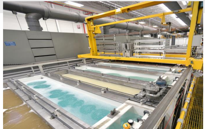
Automated Tank Line