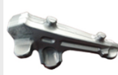
Machined Near Net Forging